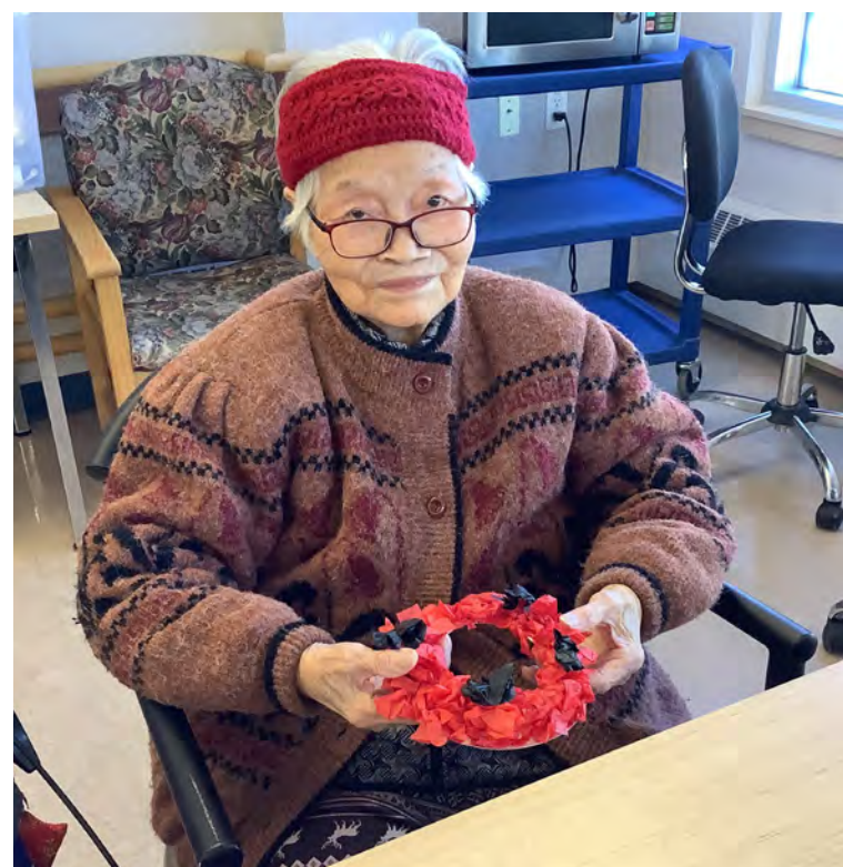
Residents honoured Canada's Veterans on Remembrance Day by making wreaths.