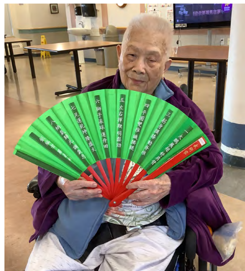
Enjoying Tai Chi.