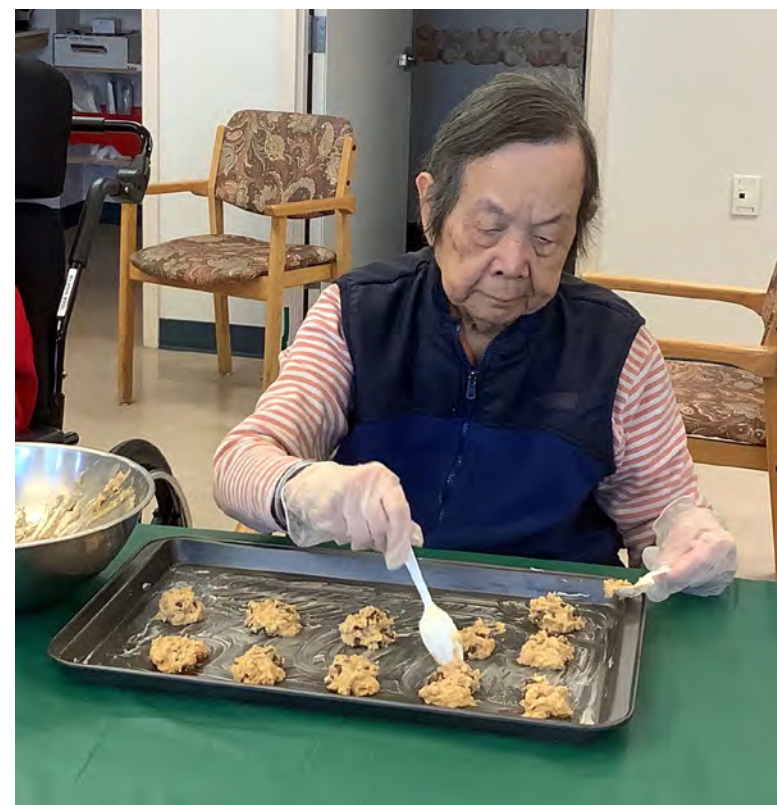
Time to make some cookies!!!