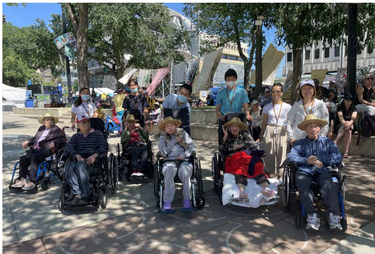
Residents enjoying the Street Performers Festival.