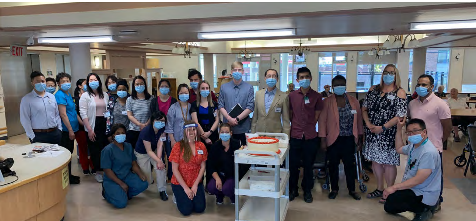
Some of the ECCC staff team celebrating the unveiling of the new organizational name —LeeCaring Communities.