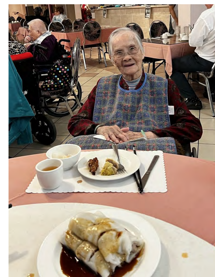
Enjoying a Dim Sum outing!