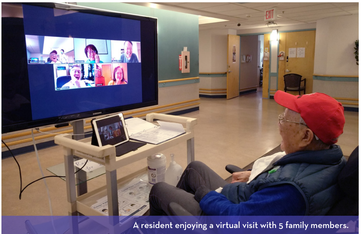
A resident enjoying a virtual visit with 5 family members.