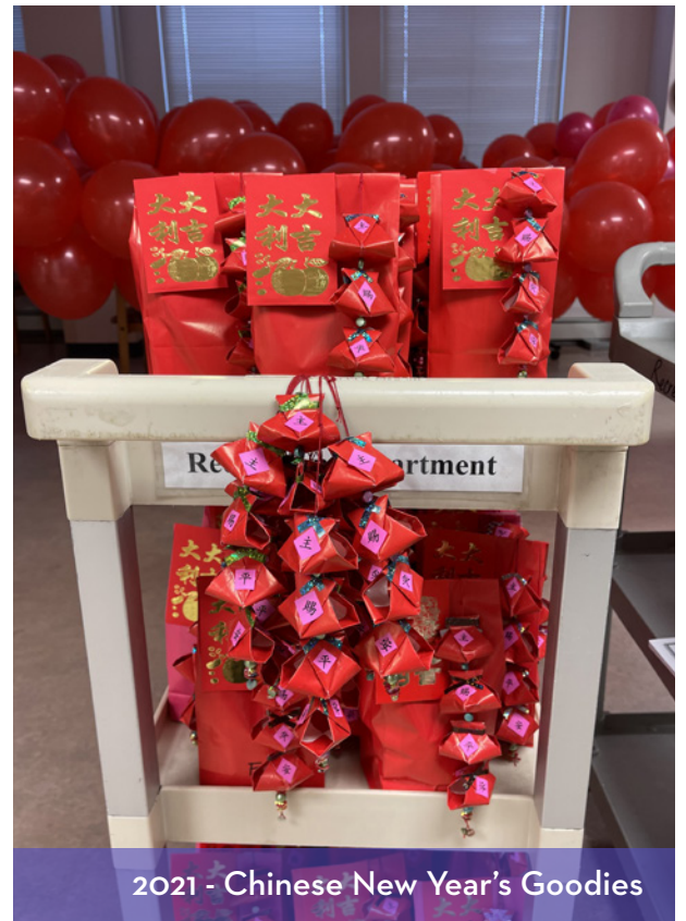
2021 - Chinese New Year's Goodies

Once the outbreak was declared over, the activities were restarted much to the delight of everyone! Chinese New Year's was the first event to take place post outbreak. It was so heart-warming to see the smiles and to hear the laughter from our residents and staff. Here are a few photos from some of the events at the facility.