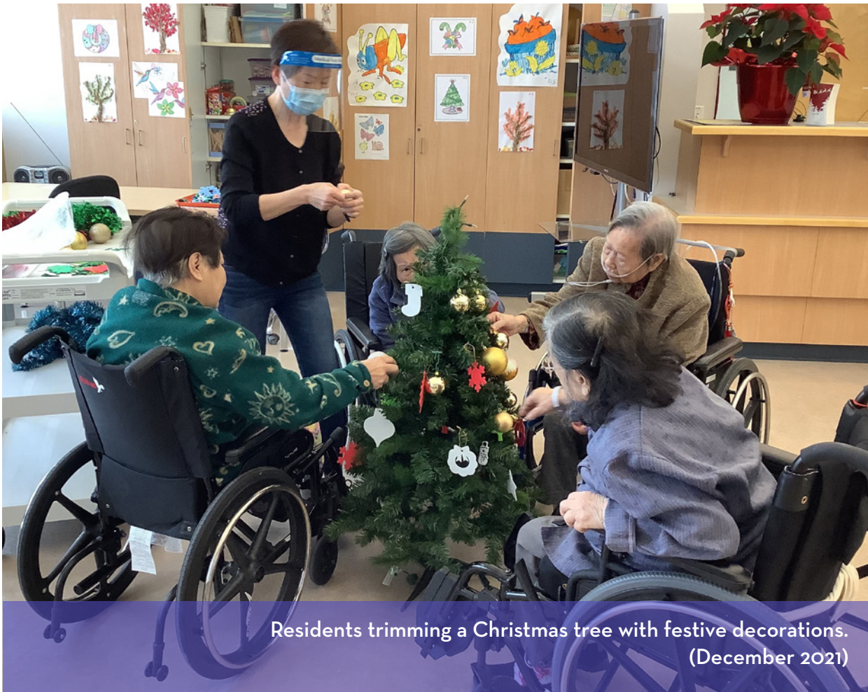
Residents trimming a Christmas tree with festive decorations. (December 2021)