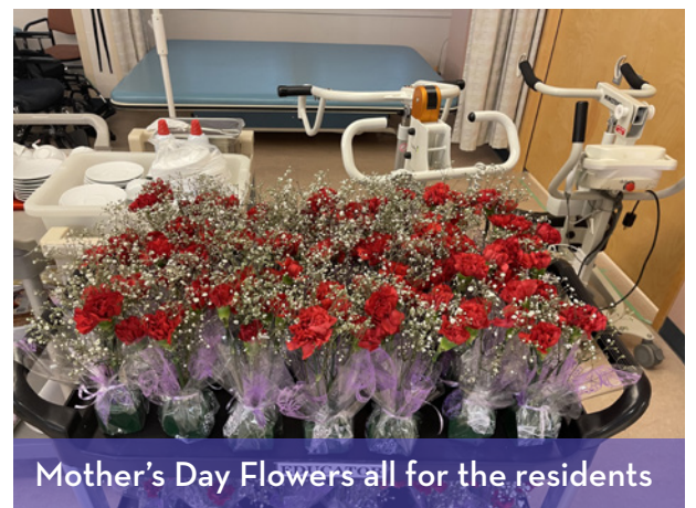
Mother's Day Flowers all for the residents