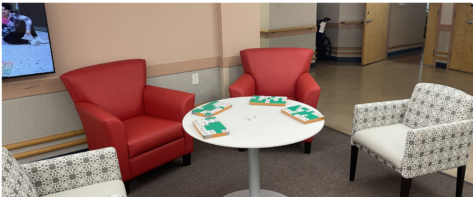
The newly renovated Newton and Wei Ting Lounge space is a comfortable place to gather.

When the COVID 19 outbreak began at the Care Centre, the site needed to follow strict outbreak protocols. This meant staff were very limited in what they could provide for social and recreational activities during the outbreak. Thanks to our resident-centred employees, the Care Centre was able to provide hundreds of virtual visits to residents and families during our outbreak. This was a way for families to stay connected and even celebrate some special occasions like birthdays with numerous family members participating.