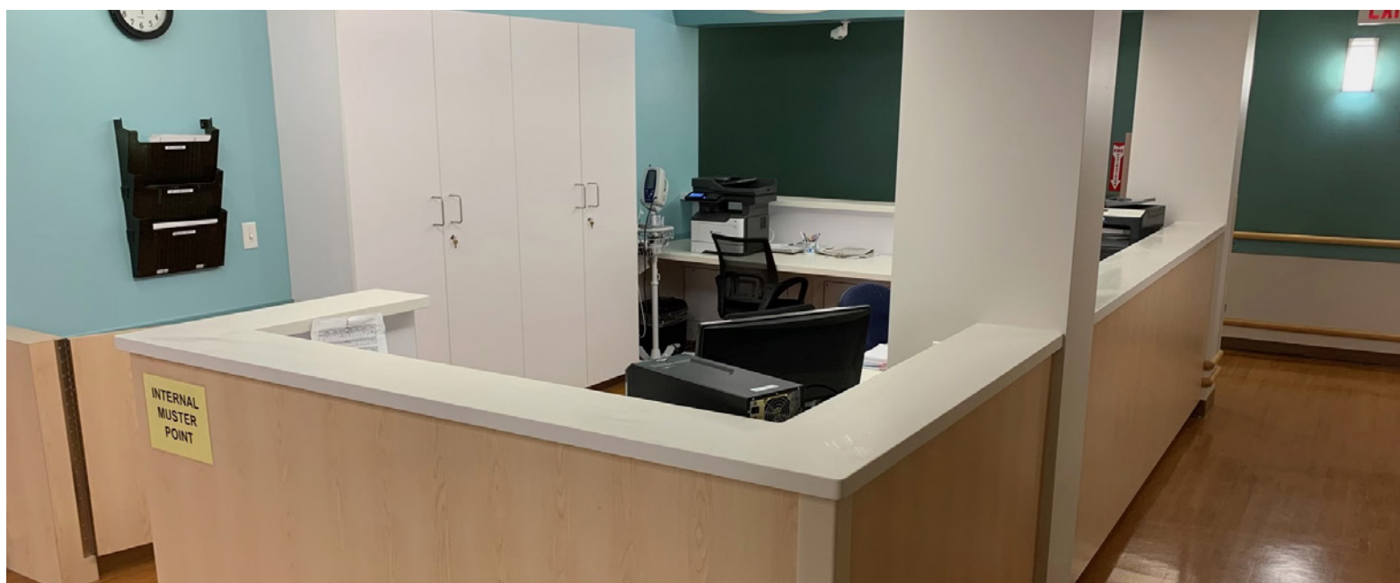
Upgraded nursing station on the main floor.