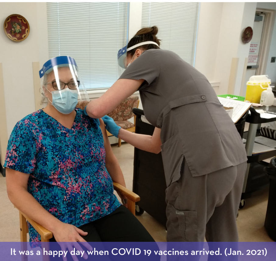
It was a happy day when COVID 19 vaccines arrived. (Jan. 2021)